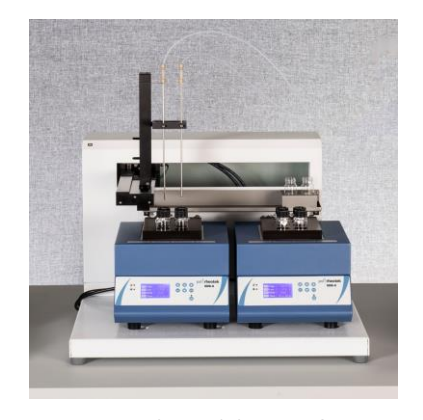
Auto sampler with heating & Stirring blocks