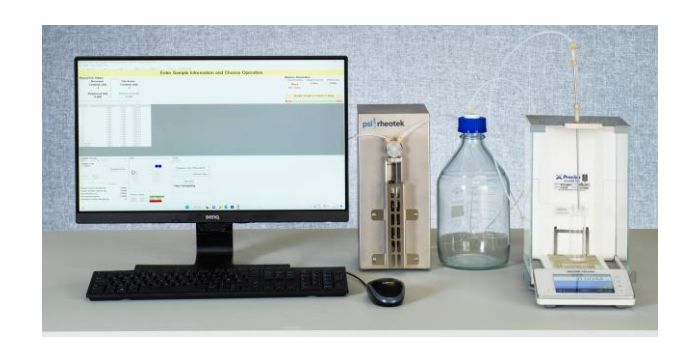
iSP-1 Sample Preparation